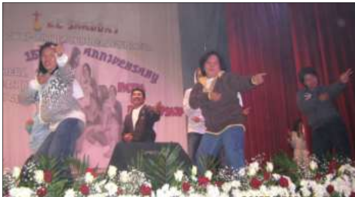
A song and dance number by members of the El Shaddai group.