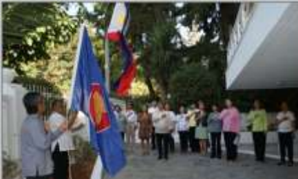
Athens PE personnel at the flag raising ceremony during the ASEAN Week celebration held at the Embassy grounds.