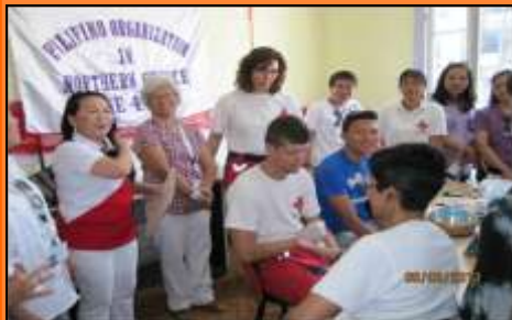
Free Medical Health Screening for OFWs in Thessaloniki, Greece in celebration of 2013 Migrant Workers' Day held on 10 June 2013