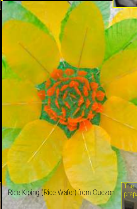
Rice Kiping (Rice Wafer) from Quezon

The WIC ladies were given a glimpse of the country's tourist attractions and were enticed to visit the Philippines with videos of the catchy "It's More Fun in the Philippines" and El Gamma Penumbra's creative shadow performance of "Piliin mo ang Pilipinas." The Ambassador