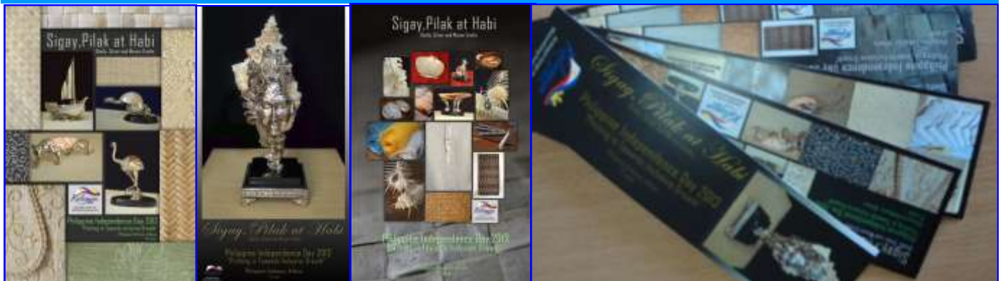
(From left to right) The 2013 Philippine Independence Day Posters and bookmarks which were given away to the guests during the event.