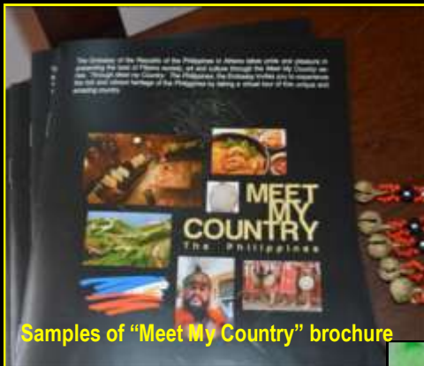
Samples of "Meet My Country" brochure

Continued from page 1)... Meet My Country