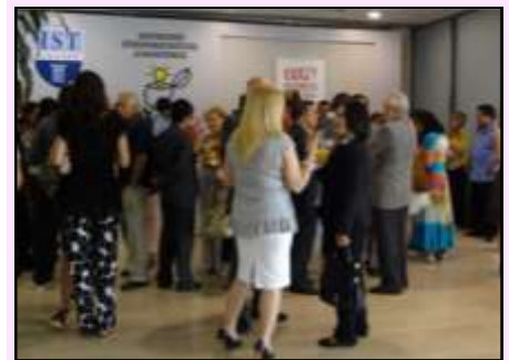
Screening of "Donsol" at IST College.

On 03 July, Athens PE together with the Independent Science and Technology (IST) College, hosted the film screening of "Donsol" at IST College in Athens.