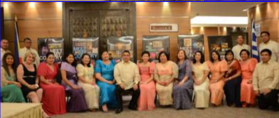
(Clockwise) "Sigay, Pilak at Habi" (shells, silver, and woven crafts) exhibit; Rice Kipping (Rice wafer) chandelier from Quezon Province ; and Officers and staff of the Philippine Embassy in front of the "Meet My Country Posters."