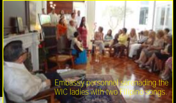
Embassy personnel serenading the WIC ladies with two Filipino songs.

Embassy staff and family members serenaded the WIC ladies with a rendition of classic and contemporary Filipino musical numbers such as the folk ballad "Anak," OPM love songs "Hanggang" and "Kahit Isang Saglit," the