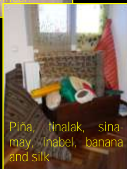
Piña, tinalak, sinamay, inabel, banana and silk