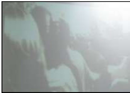
The film "Rigodon" during the cineforum held at the Philippine Embassy.

The Philippine Embassy conducted a mini-Cineforum on Migration in commemoration of the Month of Overseas Filipinos (MOF) and International Migrants Day on Saturday, 12 December 2010 at the embassy's premises. The films were provided by the Commission of Filipinos Overseas (CFO).