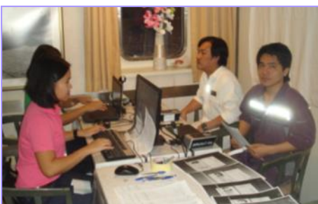
On board on board MV Louis Crystal on 12 October 2012