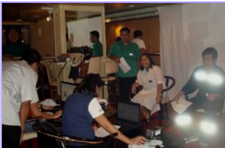
On board MV Thomson Majesty on 03 October 2012