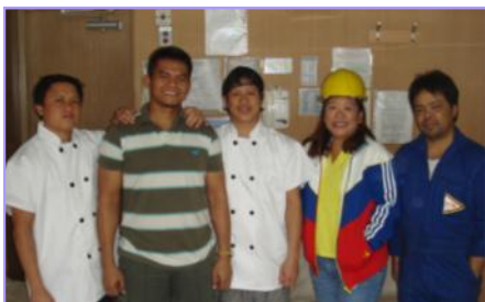
On board M Tanker Andromeda on 11 October 2012