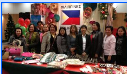
The officers and staff of the Philippine Embassy during the 13 th International Christmas Bazaar which was held from 24 to 25 November 2012 at Helexpo Palace, Athens.

Filipino cooked food (pancit, puto, lumpiang shanghai, longganiza, empanada, butsi and siopao) that have been enjoying popular patronage were also sold during the event. ■