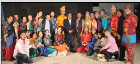
Embassy officials pose with the Kaloob group after the latter's performance at Outdoor Theater of the Sports and Cultural Center of Nea Makri, Marathonos, Greece.

Members of the Filipino community numbering to 80 trooped to the Open Theater to watch the group's performance. The Filcom members rented a bus during the opening and the closing ceremonies of the Festival to catch the Group's presentations.