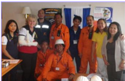
On board MV Cosco Ningbo at Perama Port in Piraeus, Athens, on 7 September 2012.