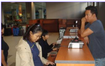
At the Piraeus Port Terminal capturing seafarers on board MV Crown Princess and MYS Wind Spirit on 20 October 2012