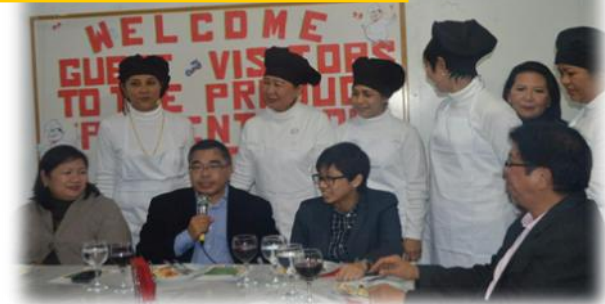
Embassy officials attended the POLO's Technology-Transfer Training on Mediterranean Cooking Class held at the VISMAG Center.

In the face of the lingering economic recession in Greece since 2008, Post has strengthened its on-site reintegration preparedness program in anticipation of any untoward displacement of overseas Filipino workers, as a result thereof. Greece basically caters to household workers only.