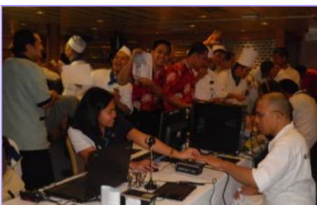
On board MV Norwegian Spirit on 22 October 2012