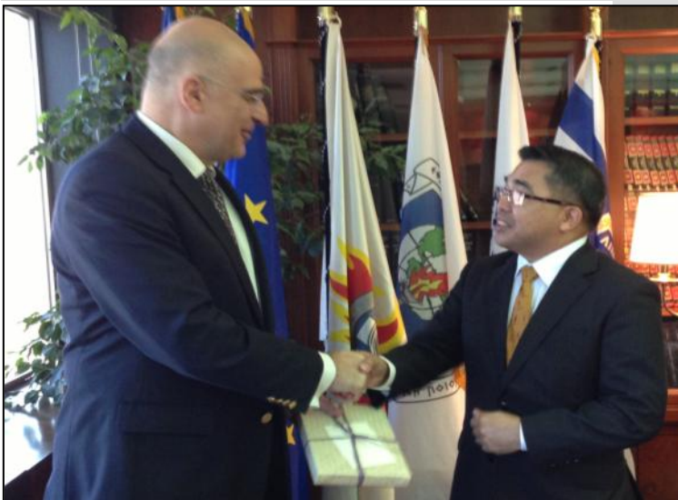
Ambassador Meynardo LB. Montealegre and Minister of Public Order and Citizen Protection Nikolaos Dendias exchange views during the courtesy call of the Ambassador on 04 December 2012.

Philippine Ambassador to Greece Meynardo LB. Montealegre paid a courtesy call on 04 December 2012, on Minister of Public Order and Citizen Protection Nikolaos Dendias.