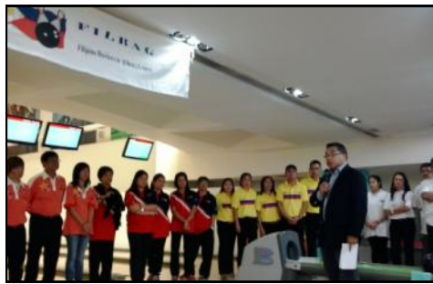
Ambassador Montealegre attended the FILBAG 10th Annual Bowling Team Tournament Opening on 14 October 2012 in Patision, Athens