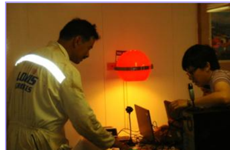
On board on board MV Louis Olympia on 08 October 2012