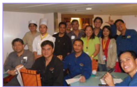
On board MV Grandeur of the Seas on 19 October 2012