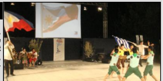
The Kaloob performs "Maglalatik" to the tune of "Zorba the Greek" during the closing ceremony held at the Alsos Veikou Open Air Theater, Galatsi, Greece.

The Filcom members felt very proud to witness the group's lively and colorful presentations and marveled at the well-researched and authentic rendition of the Filipino traditional music and dances. They expressed the hope that another Philippine group will visit Greece soon to showcase the rich cultural heritage of the Philippines through dance and music to the Greek audience.