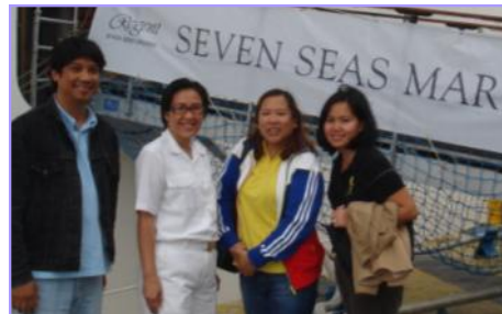
On board MV Seven Seas Mariner on 23 October 2012

OAV Field Registrations in Corfu, Greece, 09 September; Nicosia, Cyprus, 14-16 September; Thessaloniki, Greece, 14 October; and Kos and Rhodos Island, Greece, 25-27 October 2012