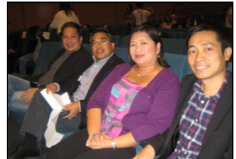
Ambassador Montealegre attended the KA-PAMILYA FAIR and TFCKat Contest held 14 October 2012 at Danaos Theater.