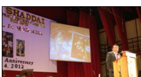
Ambassador Montealegre delivered his inspirational message during the 19th Anniversary of El Shaddai held on 04 November 2012 at Leondio Lykeio.