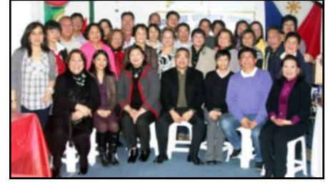
Embassy officials attended the Accredited Community Partner (ACP) Christmas Get-Together and Oath Taking Ceremony held on 08 December 2012 at VISMAG Center.