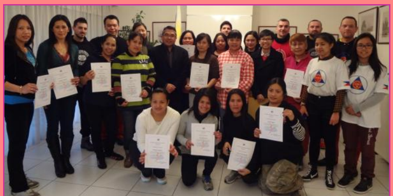
Athens PE presents certificates of appreciation to the participants of GAD Basic Self Defense Awareness and Skills Training.

The participants expressed appreciation for the said training and hope that the Embassy will continue this kind of program to empower the OFs especially the women. The participants informed Post further that they will teach the techniques they have learned during the training to their children. ■