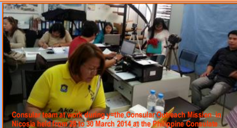
Consular team at work during the Consular Outreach Mission to Nicosia held from 28 to 30 March 2014 at the Philippine Consulate.

During said mission, POLO-OWWA Nicosia also took the opportunity to provide information to Filipinos on the Philippine government's programs designed to empower OFWs and their families in