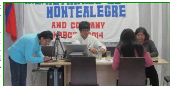
Data capturing and processing of e-passport applications of the Filcom in Rhodes by the Embassy's consular team on 01 March 2014.

The city of Rhodes is the capital of the island of Rhodes, part of the Dodecanese group of islands, and located approximately 18 kilometers southwest of Turkey in the eastern Aegean Sea. It is about 629 kilometers from Athens, and has an estimated population of 115,000 to 120,000. The city hosts an estimated 150 Filipinos, most of whom are household service workers, and who are members of the FWAR and the Union of Philippine Migrants. ■