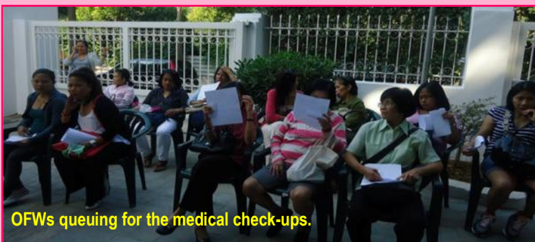
OFWs queuing for the medical check-ups.

On 08 June 2014, another health screening was held for the OFWs. Hundreds of OFWs mostly household workers availed of the quarterly free medical outreach (health screening) of POLO conducted at the grounds of the Philippine Embassy in Athens, Greece. ■