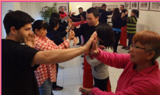
Practical demonstration of self-defense techniques.

The Philippine Embassy in Athens, Greece conducted Basic Self-Defense Awareness and Skills Training for the female members of the Filipino community as part of its Gender and Development activities for 2014 and in time for March's celebration of the Women's Month. The training was held on Sunday, 09 March 2014 at the Embassy grounds.