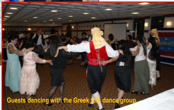
Guests dancing with the Greek folk dance group.

personnel to embassies and consulates including representatives of POLO and OWWA throughout the world. Despite the limited resources, for years, Post was able to carry out