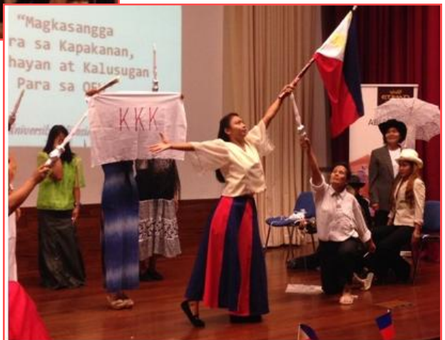
A Filipino community organization performs a skit on the history of Philippines.

Various Filipino community organizations showcased their talents in special numbers such as a group rendition of a medley of Kundiman songs, a short skit on the history of the Philippines, and folk/ethnic dances.