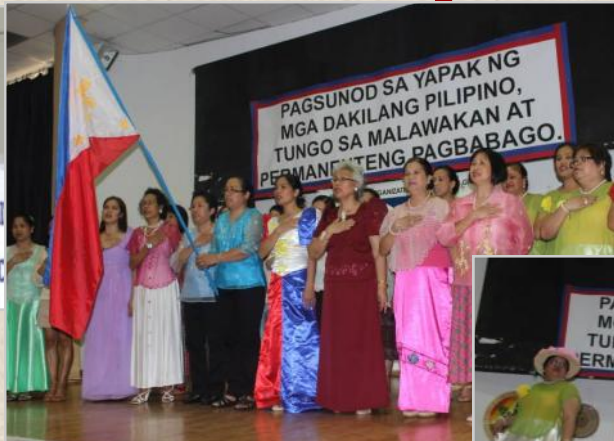
Officers of the Filipino Organization in Northern Greece Thessaloniki singing the National Anthem