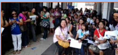
Passport applicants queuing for the renewal of their passports during the Consular outreach mission in Nicosia, Cyprus held from 26 to 30 June 2014 at the Philippine Consulate.

She also provided assistance to common complaints of Filipino workers in Cyprus. ■