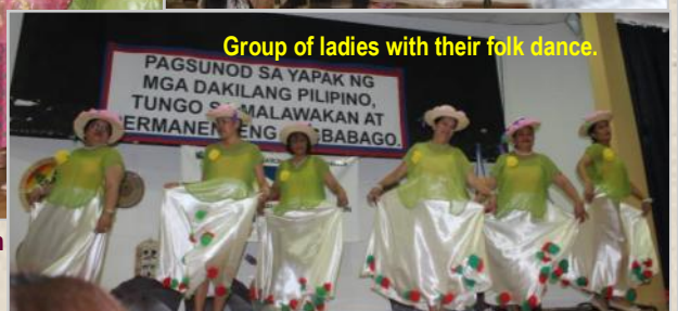
Group of ladies with their folk dance.