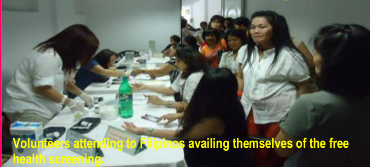
Volunteers attending to Filipinos availing themselves of the free health screening.

The Pag-IBIG Office is open from Monday to Friday from 9:00 a.m. to 5:00 p.m. and every Sundays from 1:00 p.m. to 5:00 p.m. ■