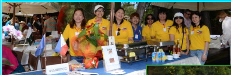
Philippine Embassy booth during the LAASA 2 nd International Food Festival held on 01 June 2014 at Nasioutzik Museum, Spata, Greece.

The organizers look forward to the Philippines' participation next year. ■