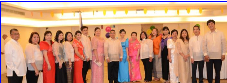
Athens PE's officers and staff during the reception hosted by the Philippine Embassy for the Filipino community held on 09 June 2014 at the Stratos Vassilikos Hotel.