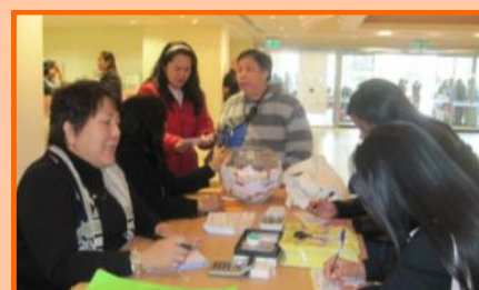
Filipinos in Cyprus pay their membership contribution on 17 December 2011 in Nicosia, Cyprus.