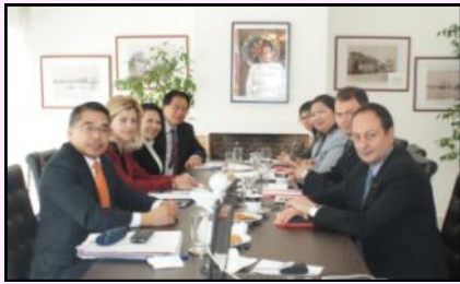
The Philippine Embassy Officials together with the Honorary Consuls.

The Embassy of the Republic of the Philippines in Athens held the first ever planning session with the Philippine Honorary Consuls (PHC) on 01 February 2012 at the Philippine Embassy to map out their work programs for 2012.