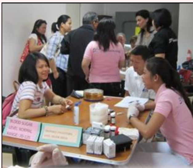
OFWs queue for the free health screening.

The Philippine Embassy together with the Philippine Overseas Labor Office and Overseas Workers Welfare Administration commemorated its 30 th OWWA Anniversary and 2012 Labor Day celebration on May 6, 2012.