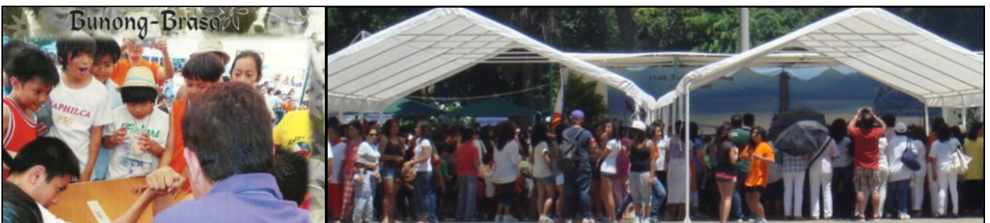
Filipino community enjoying the traditional Filipino games and cultural presentations during the afternoon program.

The Philippine Embassy wishes to thank all the following committee heads and members for a job well done: Stage Set-Up Committee; Stage Decoration Committee; Sound System Committee; Booth Committee; First Aid Committee; Program, Invitation and ID Committee and its Pinoy Got Talent and Parlour Games Sub-Committees; Kawanggawa Committee; Finance Committee; Cleanliness Committee; Peace and Order Committee; and Parade Committee. THANK YOU.