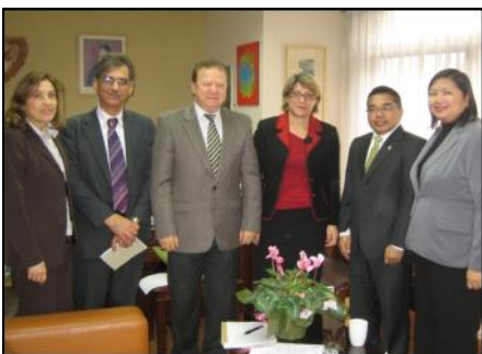
Ambassador Montealegre meets with Minister of Labor and Social Insurance Sotiroula Charalambous and other Cypriot labor and social insurance officials, 11 January 2012.