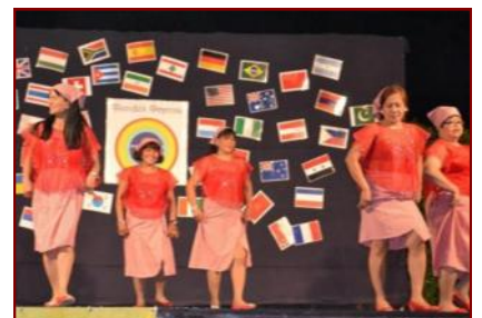
Members of the Filipino community in Thessaloniki perform a folk dance during the Food for Good 2012 festival.