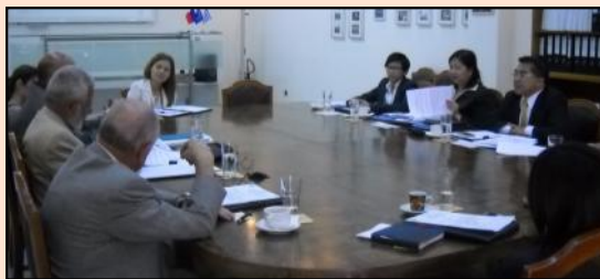
Embassy officials meet with the IST College officials held on 11 July at Moschato, Athens.

The meeting focused on how the Philippine Embassy in Athens and the IST College can work together to provide skills upgrading opportunities to Filipinos living in Greece through trainings and seminars, as well as undergraduate and postgraduate programs of study in fields such as nursing, IT, tourism, shipping, and pedagogical studies.