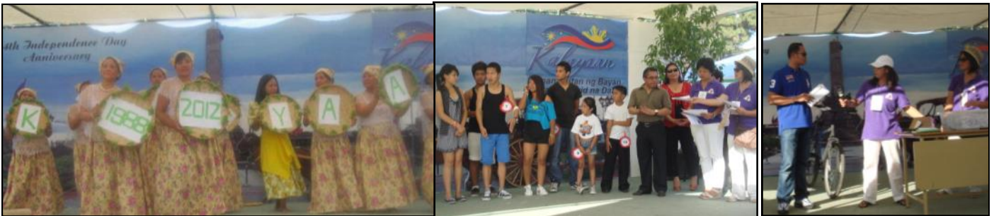
(Left to right) Filcom members presents Lulay Dance; Embassy officials together with the contestants of the "Pinoy Got Talent in Athens 2012; Kawanggawa committee drawing the raffle tickets.