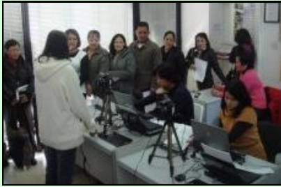
The Embassy Consular Team at work.

Cyprus, 18 to 19 February and 26 to 27 May 2012