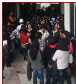
Passport Applicants queuing for the renewal of their passports during the first mobile consular outreach in Nicosia, Cyprus on 29-30 January 2011.