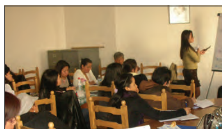
4th Batch Basic Caregiver class in Limassol