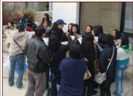
HonCon Bushnell distributing passport application forms to applicants during the consular outreach mission in Nicosia, Cyprus.