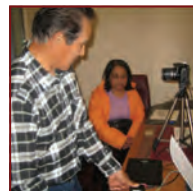
An e-passport applicant affixes his thumbprint digitally.

The team processed a total of 52 e-passport applications and attended to other various consular matters such as passport amendments and dual citizenship matters.