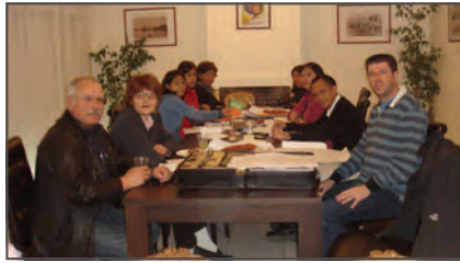
Initial meeting of the Philippine Embassy Crisis Management Team with the representatives of the Dutch company Royal BAM Group concerning the evacuation of their Filipino employees from Benghazi, Libya to Piraeus, Greece.