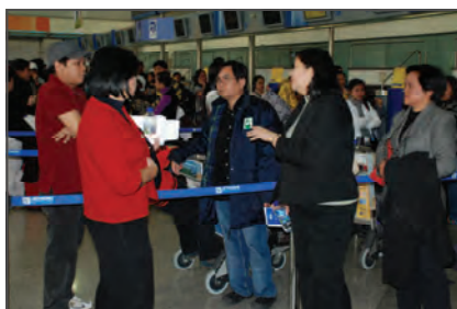
Philippine embassy representatives assist the Filipino evacuees from Libya at the Athens International Airport.