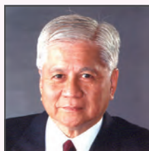
Secretary Albert F. del Rosario

President Benigno S. Aquino III appointed Hon. Albert F. Del Rosario as Secretary of Foreign Affairs on 26 March 2011.