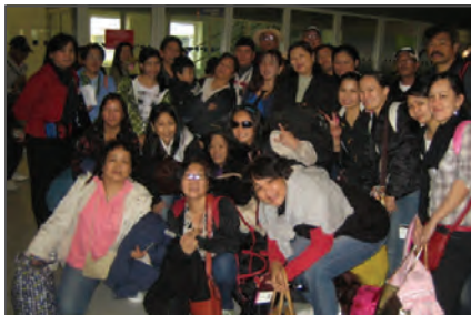
At the Athens Venizelos International Airport, Athens PE representatives met and assisted Filipinos evacuated from Benghazi, Libya through the island of Crete.