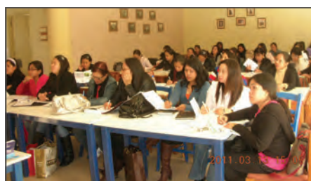
The 3rd Batch - Business Counseling Limassol