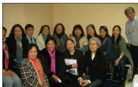
OFW Business Club officers serve as reintroduction program advocates