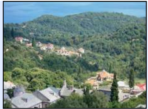
View of an area in Mt. Athos from the Ambassador's room in the spiritual cell.

centuries of Ottoman occupation and playing a major role in the formation of the Greek modern state.