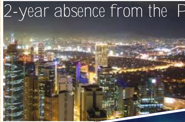
The Makati Central BUSINESS DISTRICT (CBD)

We may gripe about the Philippines being this and that, but then again, which country doesn't have its own share of problems? In other words, we should count our blessings and be glad for what we have: democracy, Filipino style; having more meals than any other people on earth; freedom of speech, especially in media. Other countries are not in this happy situation.