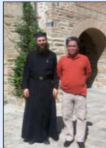
The ambassador in a monastery with a Mt. Athos monk.

"It's one of the most unique and beautiful places on earth and one of the most spiritual," the ambassador remarked. ■