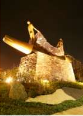
BOHIFACIO GLOBAL CITY