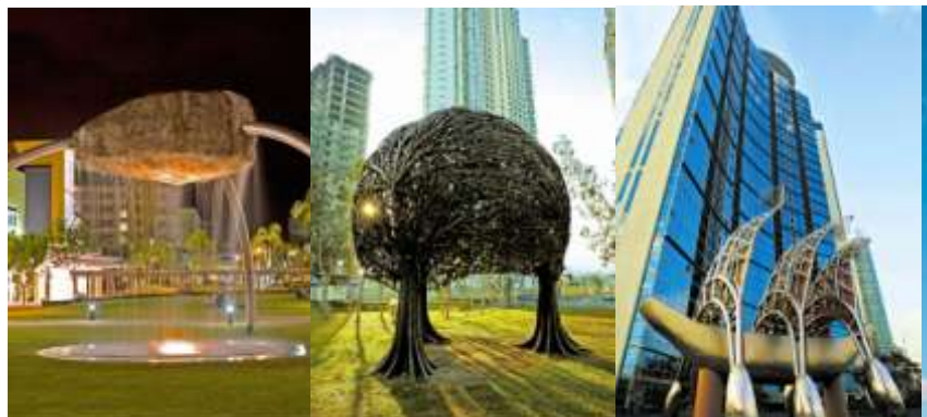
BOHIPACIO HIGH STREET SPECIFIC GRANTTY Jay Roy Name